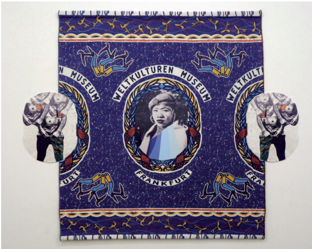
Otobong Nkanga, Facing the Opponent , 2012–13, viscose, wool, mohair, bio cotton, inkjet print on laser-cut forex plate, 165 × 187cm. Installation view, 'Trading Style', Welkulturen Museum, Frankfurt am Main, 2012

faces of natural and urban environments. While Nkanga is concerned with the devastation of resources and past and present violence throughout Africa, she shuns the monumental echoes of the past. Rather, with her characteristic forensic ethos, she produces counter-memorials: she zooms in on particular elements that make up our surroundings — particularly sand, stones and plants — to portray the struggle to (re-)define the environmental conditions in which we live.