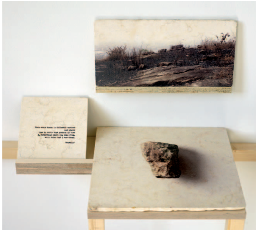
Otobong Nkanga, Taste of a Stone: Room I , 2010, installation consisting of wood and inkjet prints on Galala limestone slabs, detail. Installation view, 'Make Yourself at Home', Kunsthal Charlottenborg, Copenhagen, 2010

to forgo or forget, or simply exclude on a structural level, an investment in actual use, in practice, interpretation and ritual, including rituals of consumption — all key ingredients of Nkanga's work. The fact that she continues to use the materials accumulated by colonial institutions should not be slotted in the drawer of institutional critique. It rather marks a refusal to discount any material already in existence as a kind of cognitive currency, which is to say, a token without fixed meaning but with a potential to generate value in the process of trades, swaps, discussions, chit-chat and other means of exchange. As institutions take images and objects out of circulation, they discard them as such forms of currency. But, interestingly, if a critical perspective on colonial forms of accumulation and display is a by-product