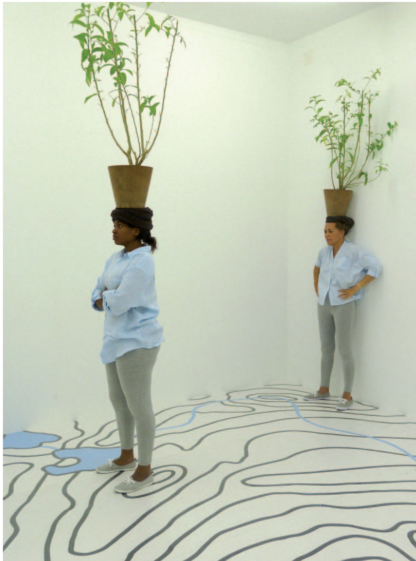
Otobong Nkanga, Diaspore , 2014, installation and 10-hour performance. Performance view, '14 Rooms', Messe Basel, 13–22 June 2014

images and archival materials – catalysts for dialogue with the viewer. In the former work, she invited guests to taste the kola nut, while in the latter she asked visitors about processes that could alter common ideas of identity, memory and perception. With their emphasis on participation, Nkanga's performances have become temporal sites for negotiating such notions and attempting to magnify their physical presence.