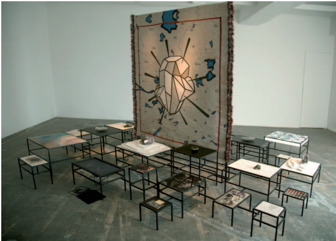
Otobong Nkanga, In Pursuit of Bling , 2014, installation consisting of 30 metallic modulated structures; woven textile pieces; video; mica; malachite minerals; images and text inkjet printed on Galala limestone; and mica insulation sheet. Installation view, 8th Berlin Biennale, 2014

to act outside binaries and to consider instead the many perspectives that define us. Consider her project In Pursuit of Bling (2014), which focuses on the myriad transformations that natural materials go through as they move from being raw matter through extraction and manipulation. 16 At the centre of the installation were two large elaborated tapestries, which rose up towards the ceiling: one of a gem pierced with needles and the other of a man and woman metamorphosing into abstract shapes reminiscent of mining landscapes. On a modular metal structure, Nkanga placed geological samples and photographs of minerals such as mica, malachite and copper, as well as texts printed on limestone. Embedded within this structure were two videos showing her presenting shiny materials to the camera and walking through the streets of Berlin wearing a crown of malachite. All these elements traced the connections between past and present desire for raw materials: from the green, copper domes of Berlin's churches to the mica used in industrial products ranging from